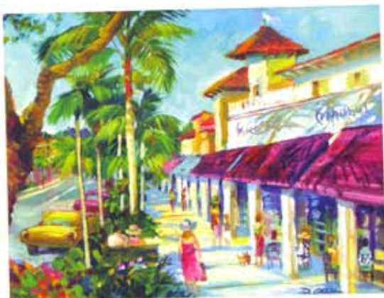
Fifth Avenue Naples