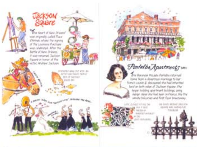
Very New Orleans